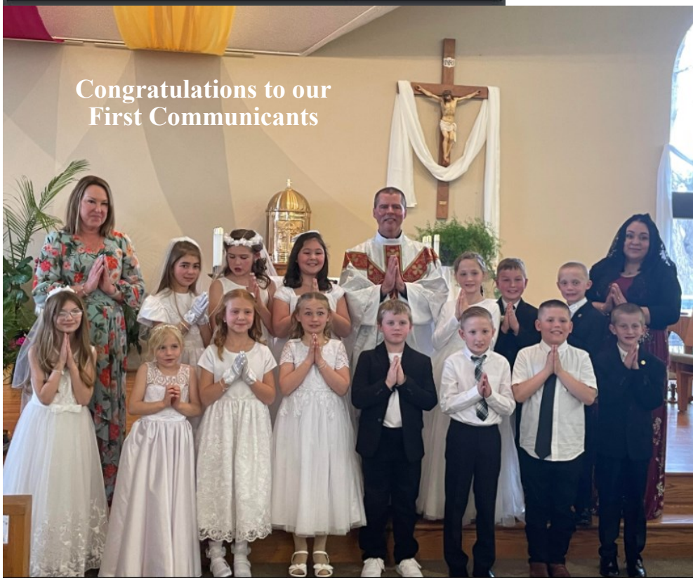
Congratulations to our First Communicants

To date we have raised $26,907 which puts us at 99% of our goal of $27,186. Please consider giving if you haven't done so already. Thank you!